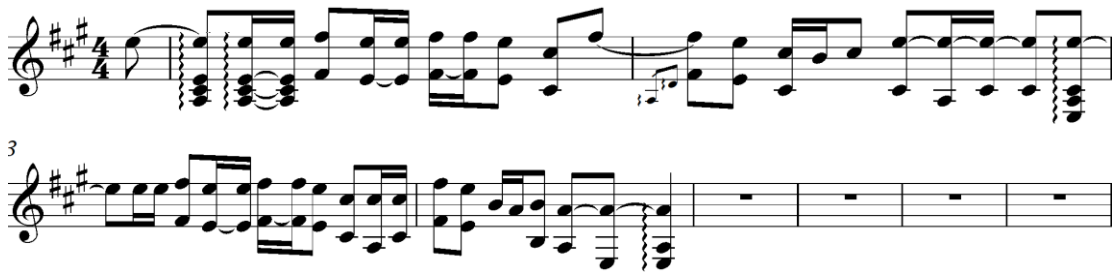
Figure 1.2a Transcribed excerpt from the same instrumental section of “Cindy Gal” seen in Figure 1.2a, performed this time by the Carolina Chocolate Drops on Genuine Negro Jig . Again, the notes in the higher octave denote the fiddle melody while the lower notes indicate the banjo part.