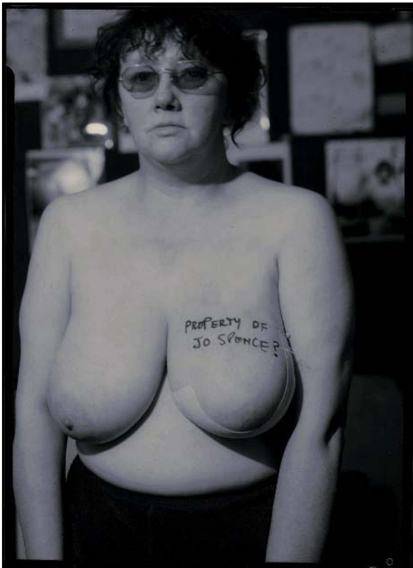
Jo Spence, “The Property of Jo Spence?” in Putting Myself in the Picture, 1982.

After looking at Spence I was left with the following questions: “Whom does Spence suggest determines how breasts should look?” and “How is the breast seen by the public?”