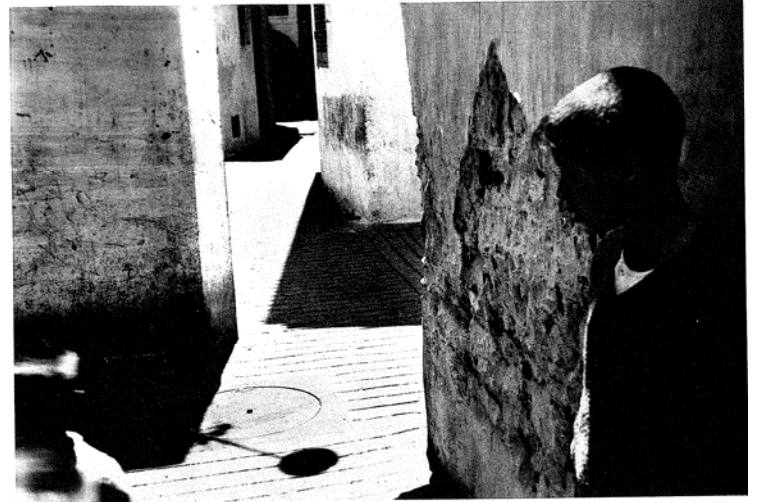
HENRI CARTIER-BRESSON: Boy in Passage, Andalusia

Bottom: "Bathers on the Ganges" detail, by Ferenc Berko (page 42).